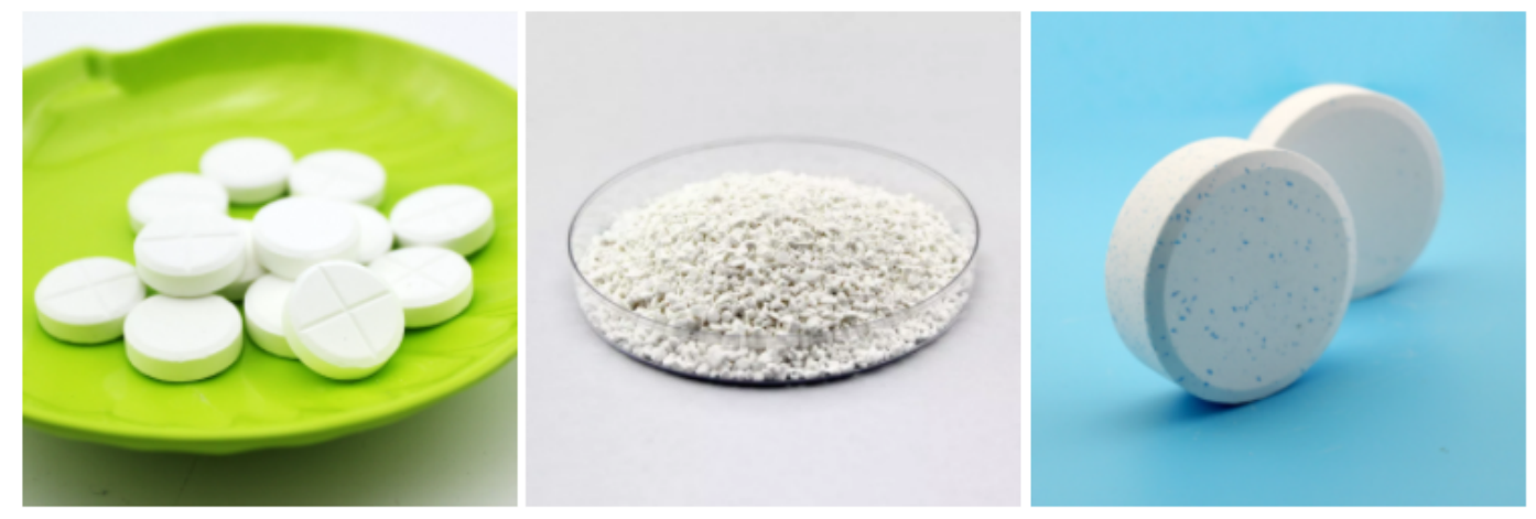
SDIC 3.3g Tablets

Trichloroiscyanuric Acid(TCCA) functions as disinfectant, algaecide and bactericide mainly for swimming pools and spas, and bleaching agent in the textile industries. It is widely used in civil sanitation preventing and curing diseases in husbandry and fisheries, fruits and vegetables preservation, wastewater treatment, algicide for recycling water of industry and air conditioning, anti shrink treatment for woolen, treating seeds bleaching fabrics, and organic synthesis.