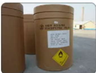
50kg Fiber Drum