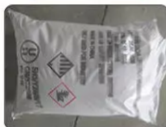
25kg Plastic Bag