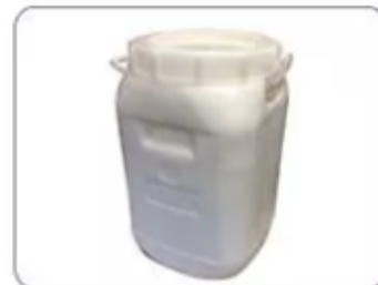
25kg drum with screw lid