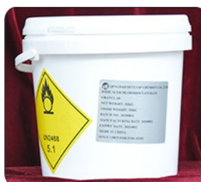
10ke Pail with screw lid