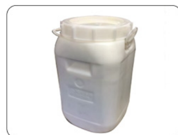
25kg drum with screw lid