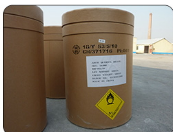
50kg Fiber Drum