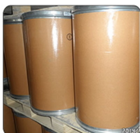
50kg Fiber Drum