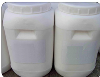
25kg Plastic Drum