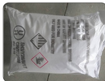
25kg Plastic Bag