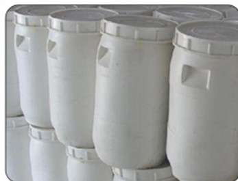
45kg Plastic Drum