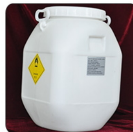
50kg Plastic Drum