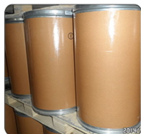
50kg Fiber Drum