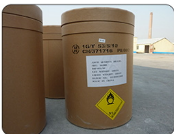
50kg Fiber Drum