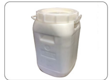
25kg drum with screw lid