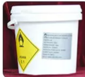
10ke Pail with screw lid