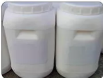
25kg Plastic Drum