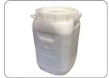
25kg drum with screw lid