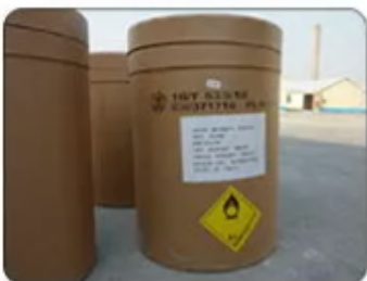
50kg Fiber Drum