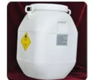
50kg Plastic Drum