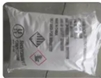
25kg Plastic Bag