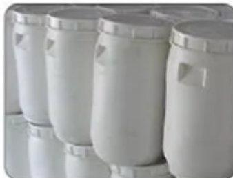
45kg Plastic Drum