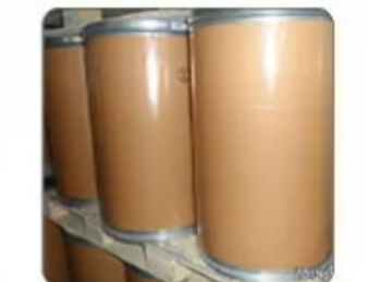
50kg Fiber Drum